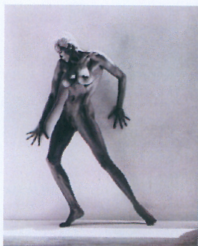
Brigitte Neilson, Los Angeles 1988